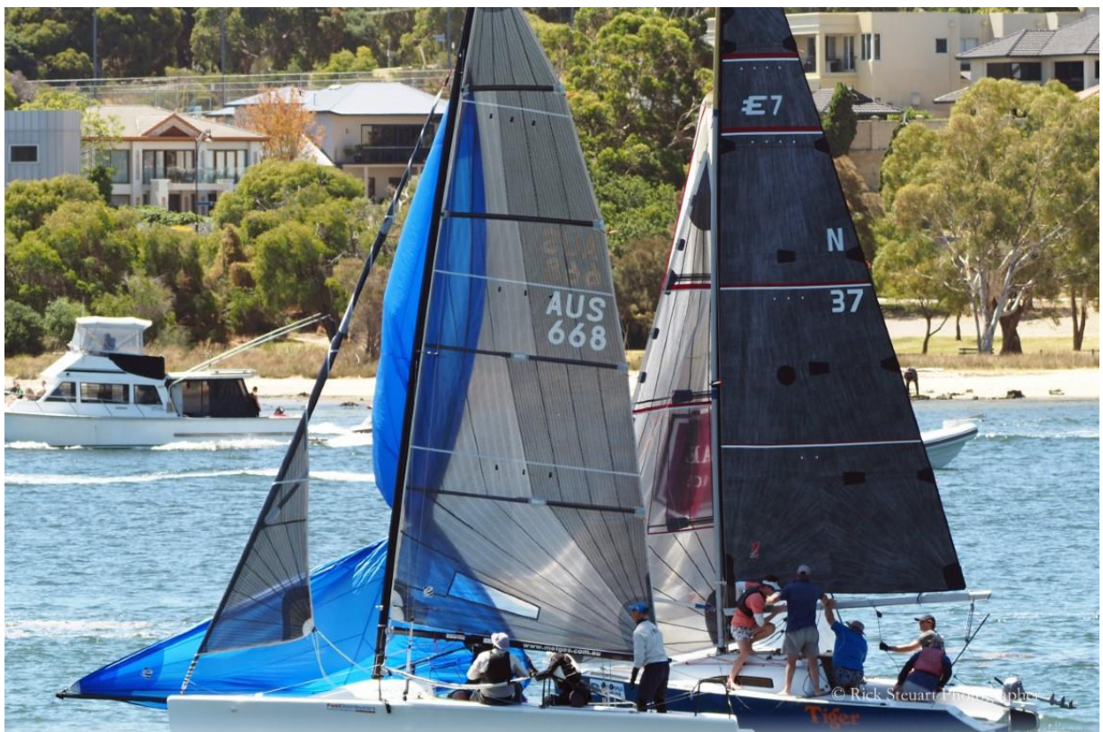
Gavin giving a Viper some spinnaker tips during the Rumble.