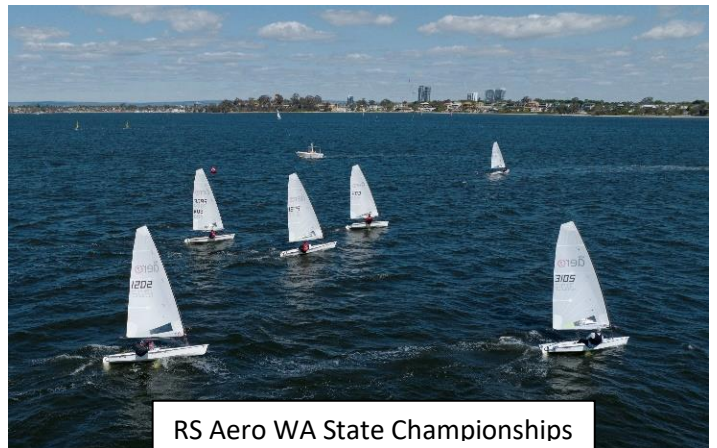
RS Aero WA State Championships

A big Thank You of all the parents, volunteers, coaches etc who have help it possible to run such a successful and busy season to date. There has been a big