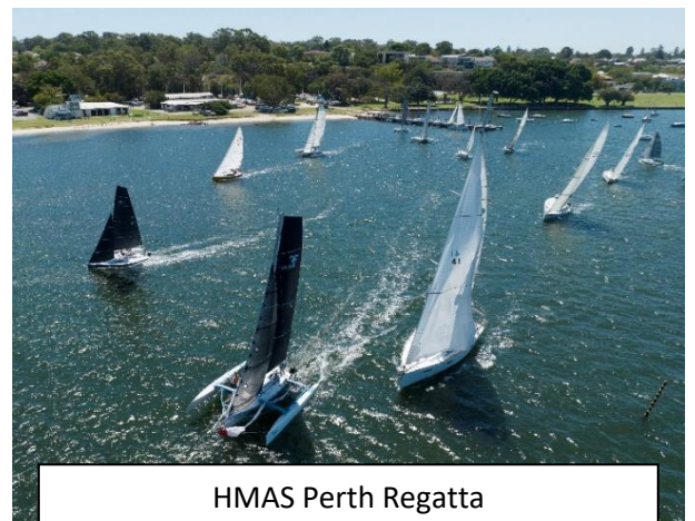
HMAS Perth Regatta