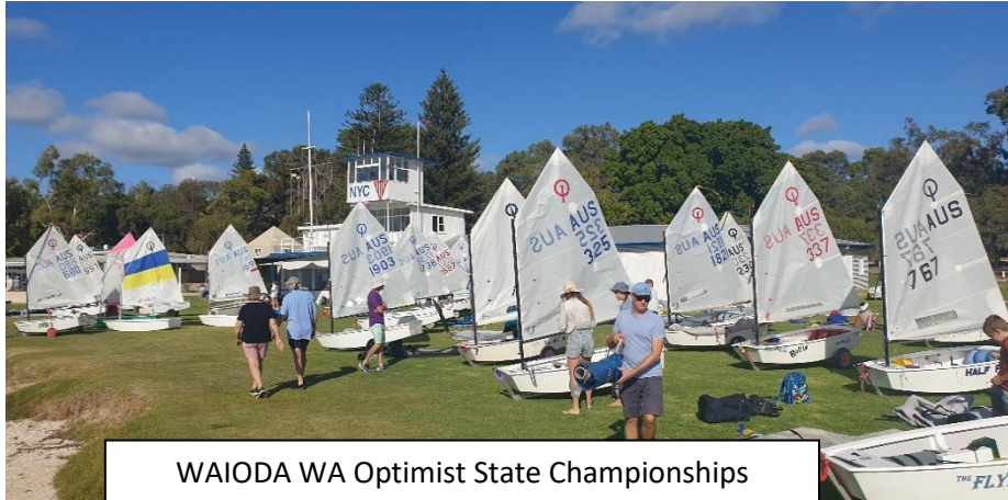
WAIODA WA Optimist State Championships

We have had a busy summer season to date both on and off the water. There have been plenty of great sailing days with close racing, our junior fleet is growing, and work is continuing on the new sail training centre now our CSRFF grant application has been approved. Sunday 23rd April is our last consistency race and picnic day is the 30 th . Our last Tackers course for the season from the 11 th to 14 th April was fully