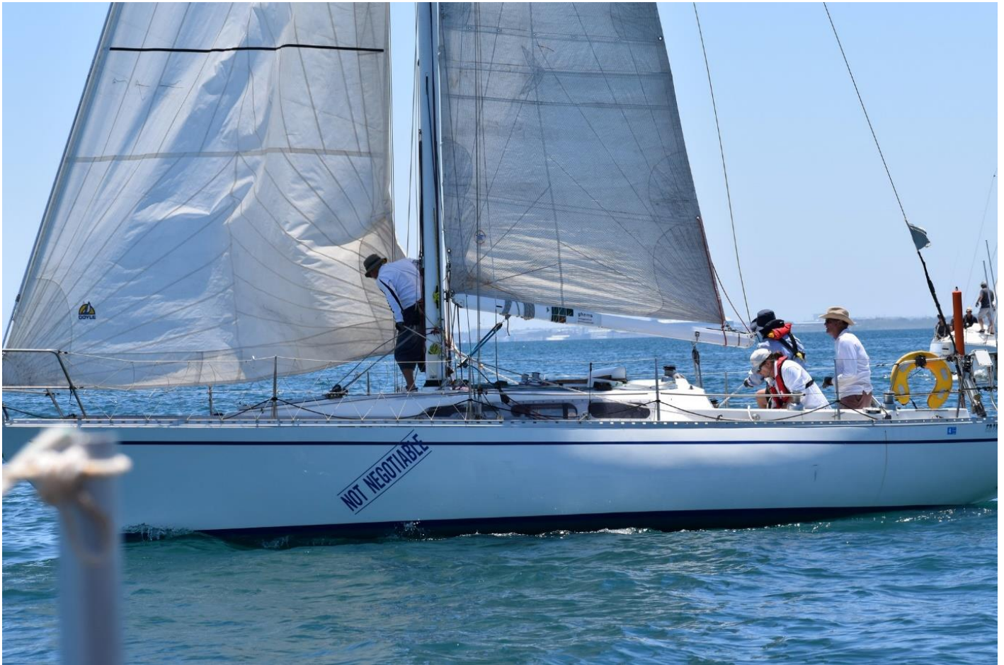
Greg Hill’s “other boat” looking for a bit more breeze at Cockburn.

With the traditional break to the NYC sailing calendar over the Christmas / New Year period, several boats from the cruiser section headed down to The Cruising Yacht Club (TCYC) for the annual Cockburn Sound Regatta. With conditions being everything from scorching hot and zero wind to good breeze and champagne racing conditions, the Neddies boats had “serious fun” getting out on the water and flying the flag in the four-day regatta. While not necessarily picking up the silverware, the skippers and crews enjoyed the variety of races and always made the time to catch up with fellow competitors at the end of each day’s racing for a cold drink and a few war stories. A big thank you to TCYC for hosting another great regatta this year.